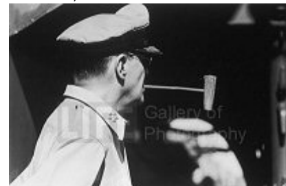
General .Douglas MacArthur