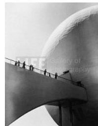
NYCity’s World’s Fair, 1939