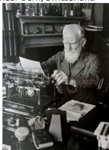
George Bernard Shaw