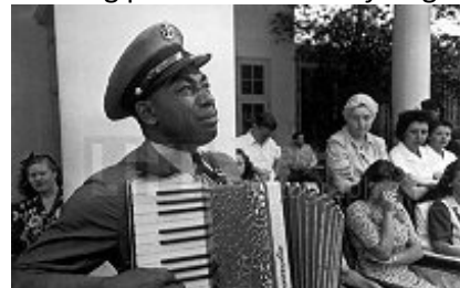
“Goin’ Home” at FDR’s funeral, Warm Springs, GA