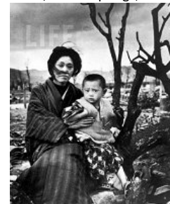
4 mo. after bomb in Hiroshima