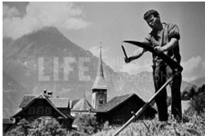
Farmer sharpening his sickle near Bern, Switzerland