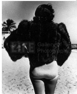
Woman in cold Miami with fur