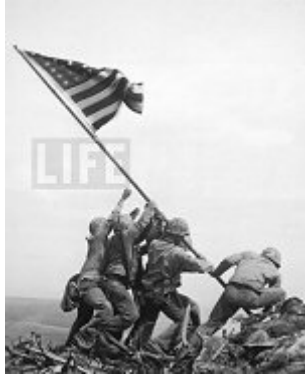
Mt. Suribachi, Iwo Jima, Feb. 23, 1945